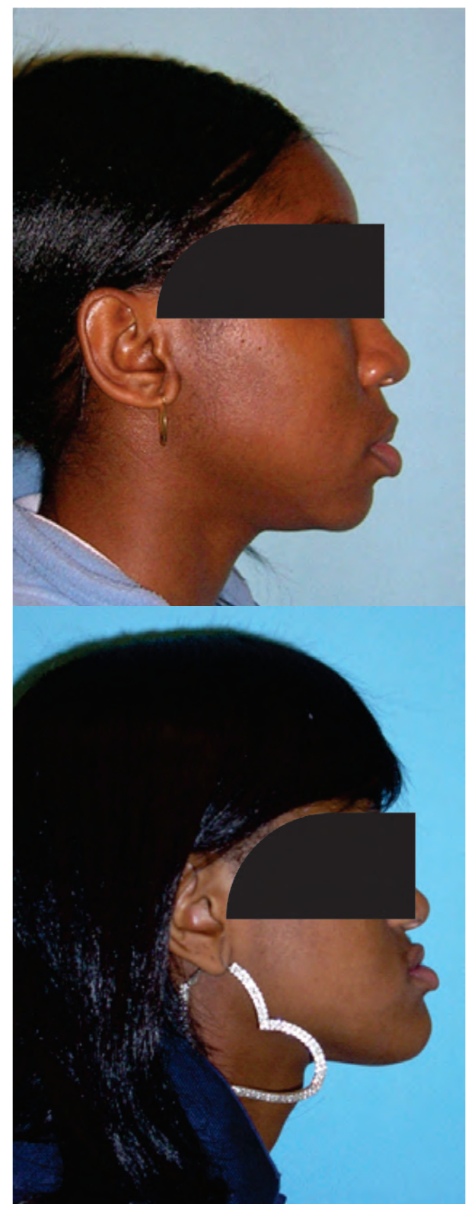
Figure 2: Example of extreme values of H angle

Ideally, the skeletal profile convexity moves in tandem with the H angle for a harmonious soft tissue profile.<sup>7</sup> Typically, a higher angle correlates with greater convexity. However, our sample showed a higher value for the H angle in relation to the norms, which would indicate more convexity, that is, a more Class II profile. Nonetheless, in mandibular prognathic patients, the influence of MYO1H may have a different effect on the soft tissue development, primarily an increased upper lip thickness as opposed to its effects on the hard tissue.6 Extreme values of the H angle are shown in Figure 2.